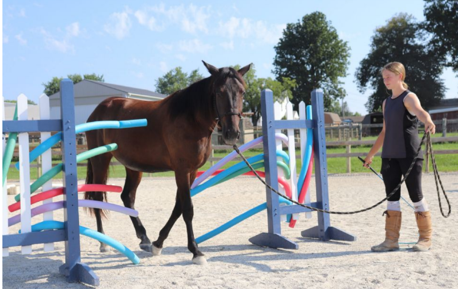
Two-year-old 14.2hh Standardbred

ZiZi is an unbacked two-year-old mare with lots of untapped potential. She has a solid foundation in groundwork and will be ideally prepared to start her career under saddle in the next couple of years. In her groundwork with the DEFHR team, she has proven to be brave over and around obstacles, including tarps, bridges, and kiddie pools. She is very social and enjoys spending time with people. If you think you may be able to give this young mare a forever home where she can learn and flourish, please get in touch.