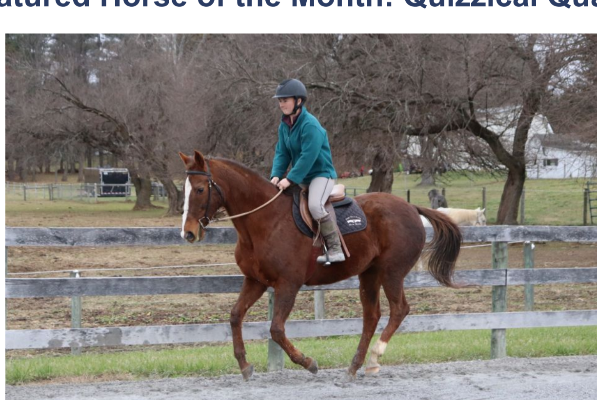
15.2hh Thoroughbred mare

Quizzical Quartz is a 20-year-old off-the-track Thoroughbred (OTTB). She arrived at DEFHR in 2019 as an emaciated neglect case and went through DEFHR’s rehabilitation and training programs. She was adopted by a college student, evented through beginner novice successfully, and was dearly loved. Unfortunately, life changes required her return to DEFHR, and now Quartz is looking to make another family happy.