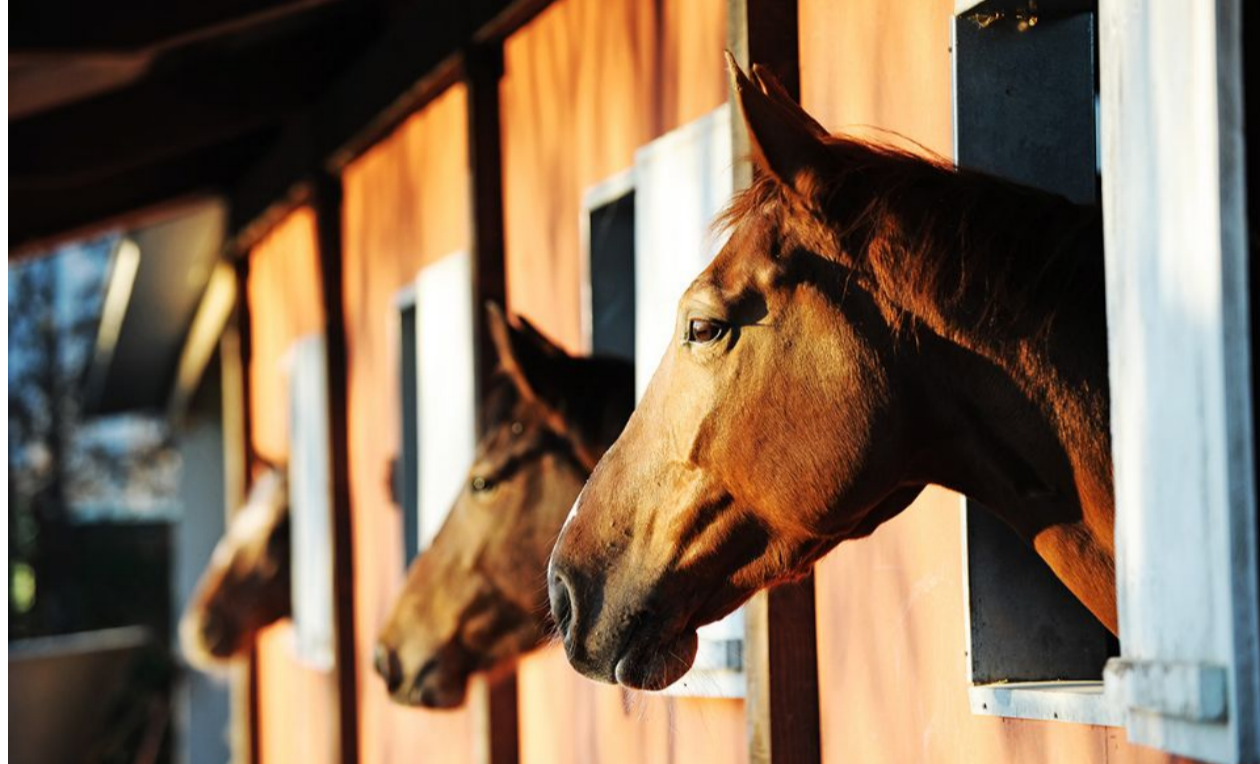
It's important to understand the role insurance coverage plays, and know when to advise of any changes in a horse's situation.