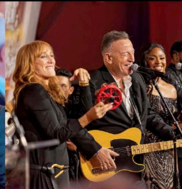
Patti Scialfa and Bruce Springsteen