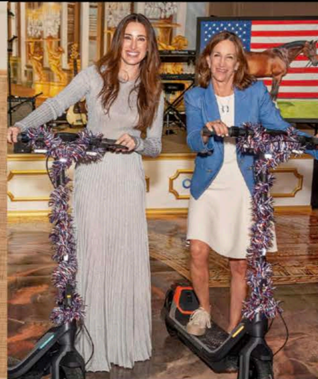
Jessica Springsteen and Laura Kraut