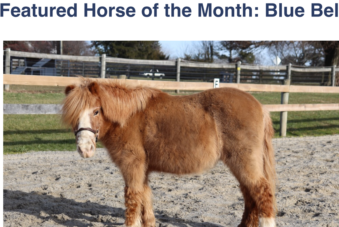
30-year-old Part-Shetland mare, 10.1hh

Blue Bell may have been named after the cow, but her whinny sounds much more like a pig! Blue Bell has a lot of hair to brush and would be perfect for kids to love. She is offered as a non-riding companion to a loving home to live out her days. She enjoys affection and has a funny personality to keep you smiling. If you are willing to provide some extra care and love to an older pony, please consider Blue Bell.