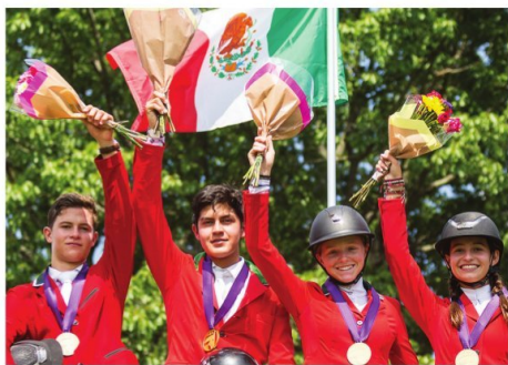
The Mexican team took show jumping junior team gold at the Adequan FEI North American Youth Championships.